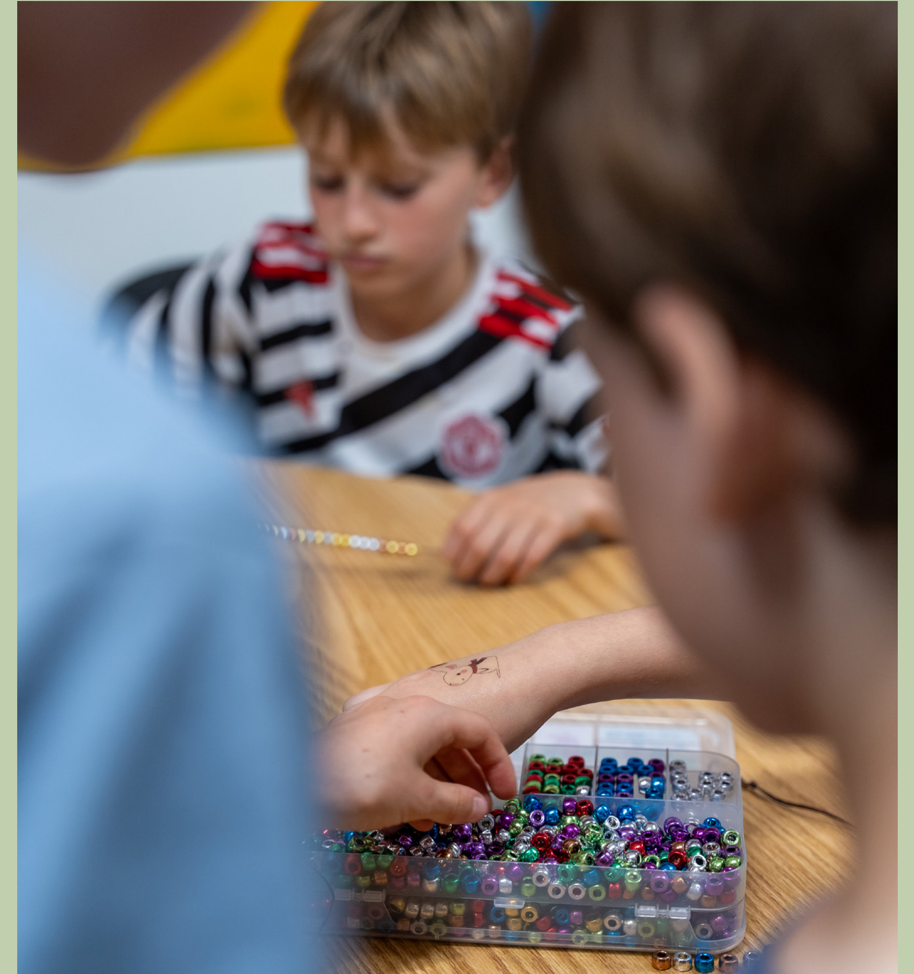
Children at a workshop run by Foundation grantee, Visyon, who have been supporting the emotional health of children, young people and their families in the Cheshire and Staffordshire Moorlands areas since 1994.